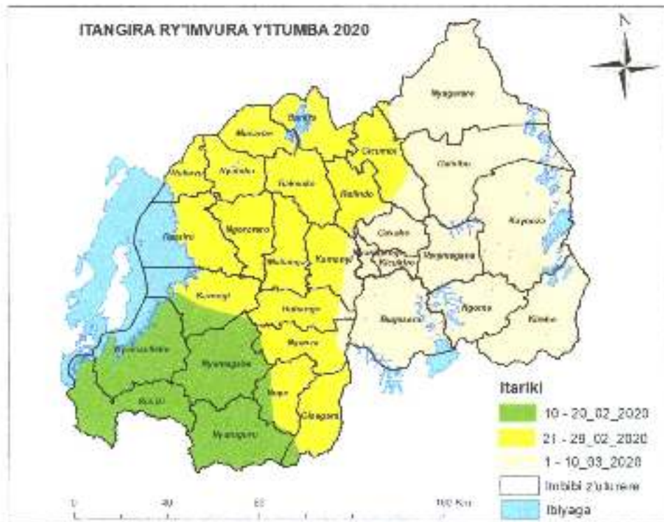
Ikarita 2: Ikarita yerekana igihe imvura izatangirira mu bice bitandukanye by'igihugu