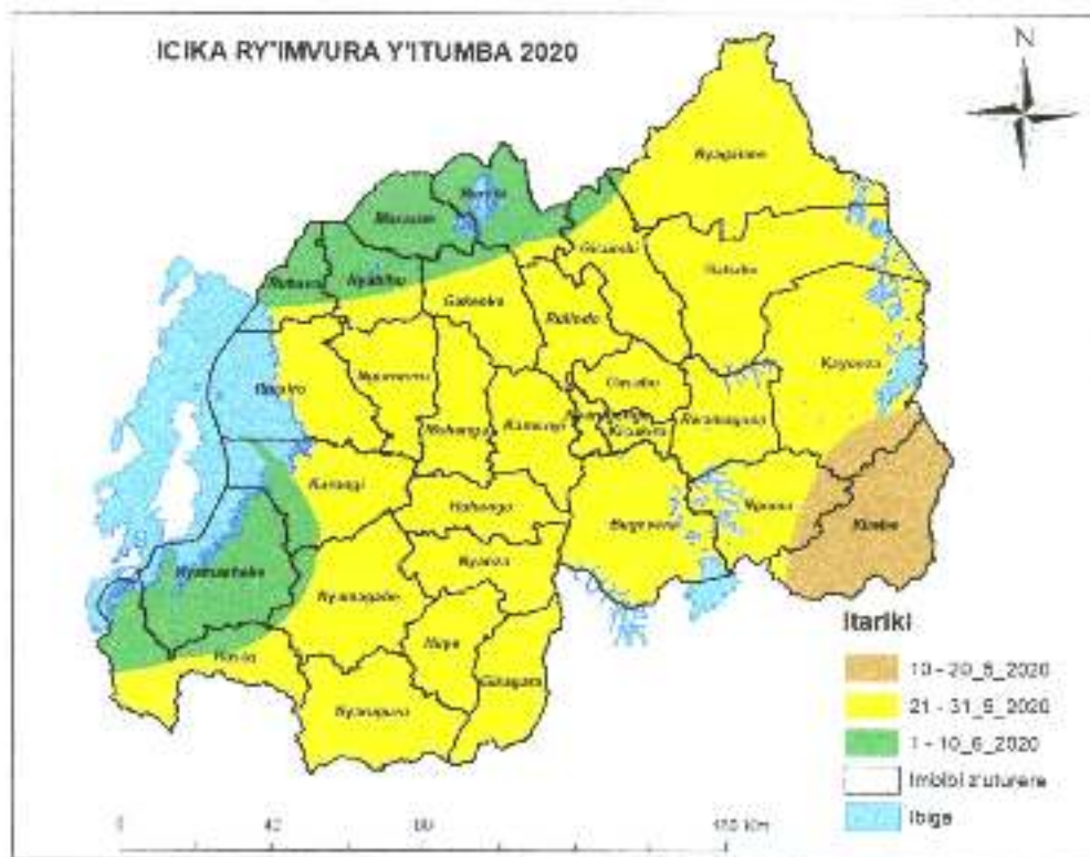
Ikarita 3: Ikarita yerekana igihe imvura izacikira

Imbonerahamwe igaragaza ingano y'imvura muri milimitero (mm), amafariki y'itangira n'icika ry'imvura y'Itumba 2020